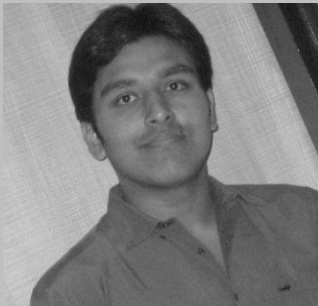
CTP, LLC, India